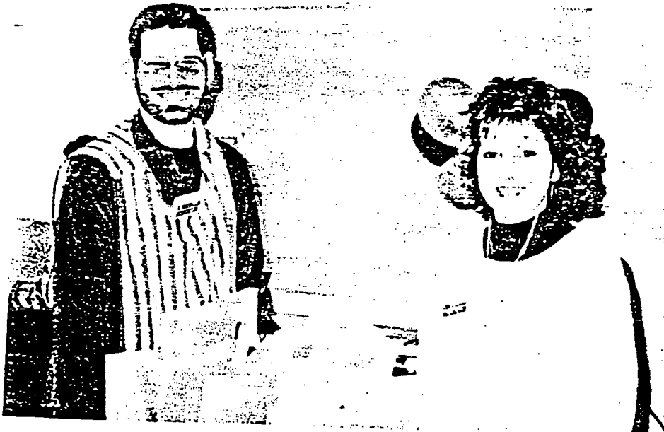
Community Building Project